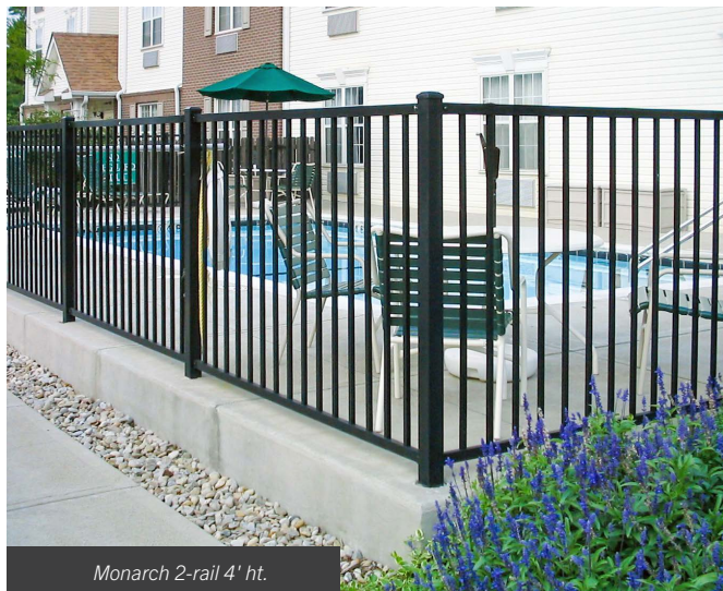
Monarch 2-rail 4' ht.