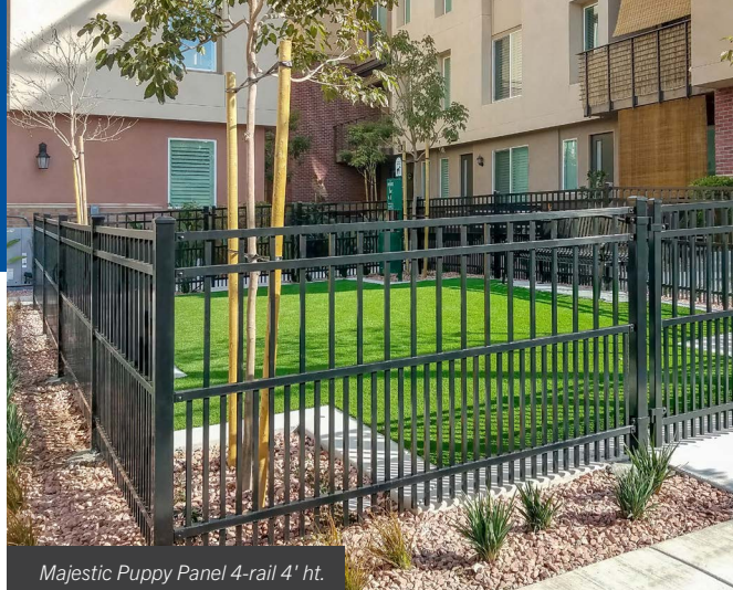
Majestic Puppy Panel 4-rail 4' ht.

Note: Classic, Majestic, Genesis & Warrior 3- & 4-rail panels are IBC compliant.